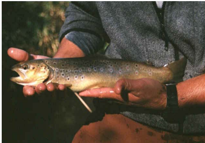
Above: Adult brown trout

The Benton Soil and Water Conservation District (SWCD) is conducting a Total Maximum Daily Load (TMDL) project on Little Rock Creek. The Little Rock Creek watershed is located within Morrison and Benton Counties. The watershed is 67,650 acres.