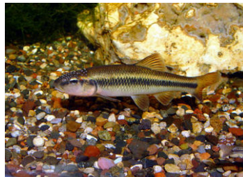
Above: Hornyhead chub

The impairment is also supported by the fact that recent surveys reveal that the fish community is dominated by tolerant warm water species, such as blacknose dace, creek chub, white sucker, central mudminnow, and bigmouth shiner. Very few obligate cold or cool water species were captured, including brook trout, brown trout, longnose dace, and brook stickleback. The presence and increased abundance of sensitive cool/cold water species would be good indicators of improved water quality.